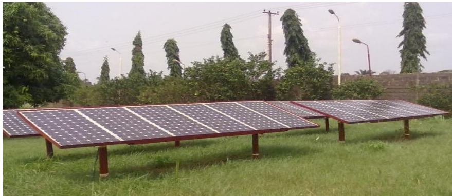
Figure 2: Solar array

The microgrid developed by ELDI's was aimed at integrating renewable energy sources (mainly solar) with both grid and DG facility. The solar array is as shown in figure 2.